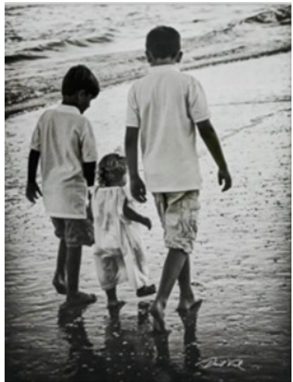
2nd Place, At the Beach