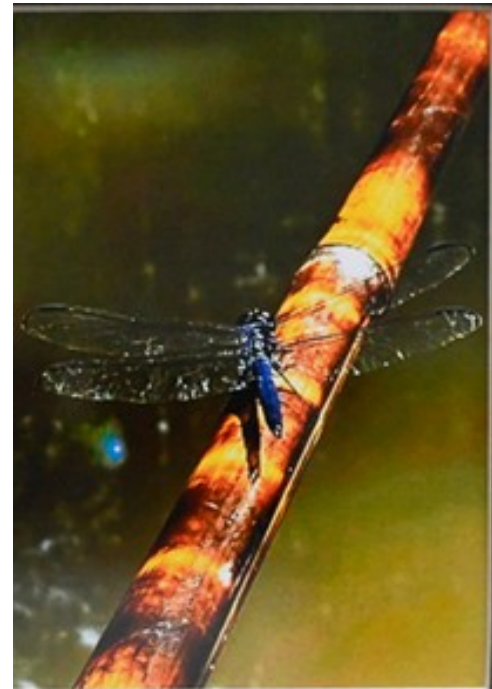
Honorable Mention, Photography Suzanne Sims Dragonfly - Fishing at the River