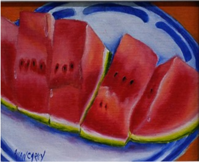
1st Place, 2D Allan Carey Cool Slice