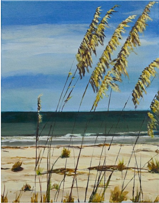
3rd Place, 2D Cathy Compton Summer Breeze